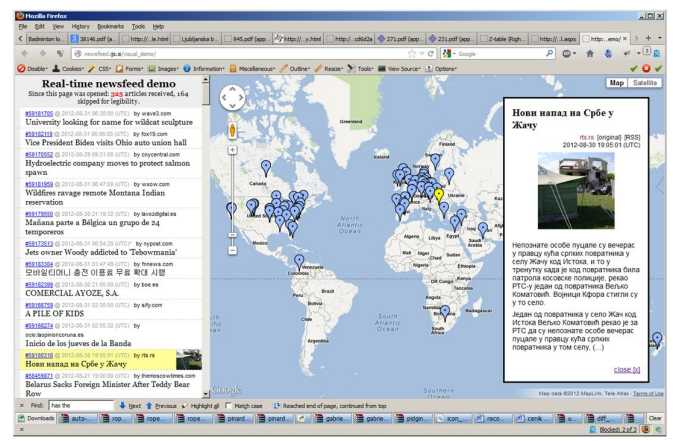
Figure 3: A real-time preview of the stream demonstrating some of the semantic annotations. See http://newsfeed.ijs.si/visual_demo/

The data provided by the pipeline is being successfully used in several multilateral projects with expected applications in cross-lingual text mining, opinion mining and recommender systems.