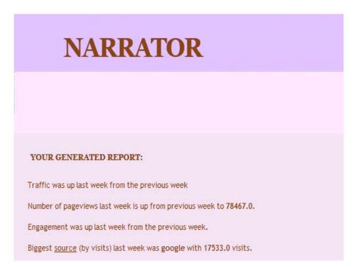
Figure 3: NARRATOR interface – generated report.

Figure 3 demonstrates a performance report generated for the website videolectures.net [5] – a website that provides free and open access educational video lectures repository. The report includes the performance analysis of the visitos to the website in the last week versus previous week. From the report it can be seen that traffic was up last week, as well as the number of pageviews and the number of visitors.